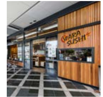
SUNSHINE PLAZA STORE