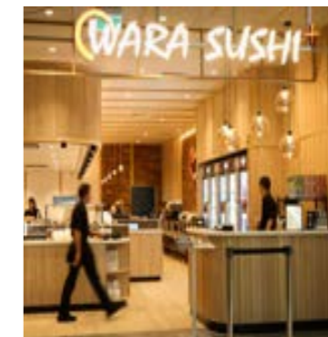
MOUNT PLEASANT STORE