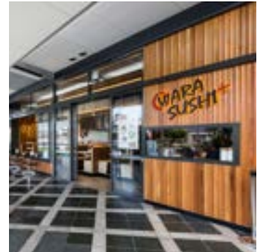
SUNSHINE PLAZA STORE