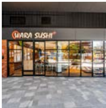
WEST END STORE