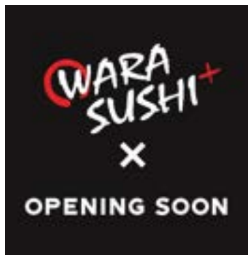
MOUNT PLEASANT STORE