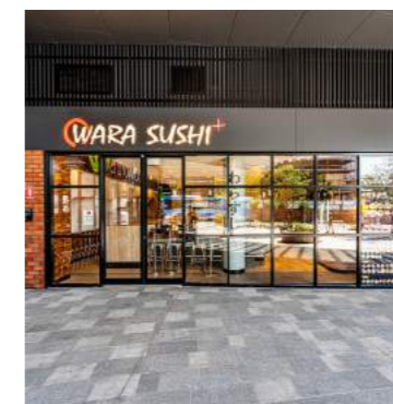
WEST END STORE