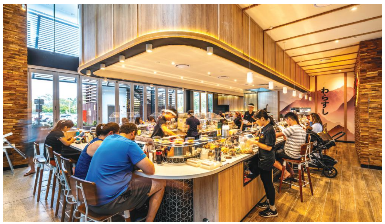
Westfield Chermside Wara Sushi Store