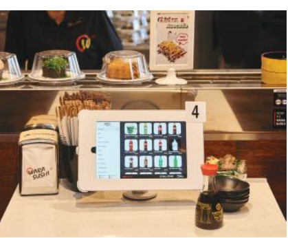
Wara sushi tablet order systems.