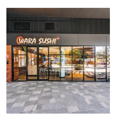
WEST END STORE