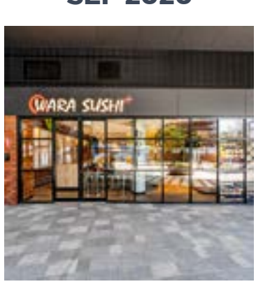
WEST END STORE