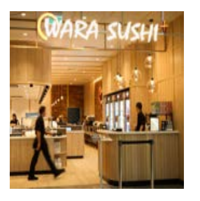
MOUNT PLEASANT STORE