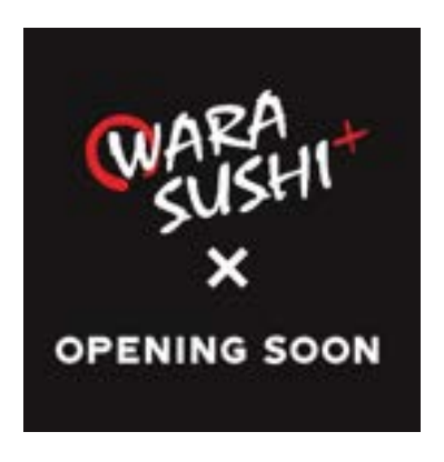
MOUNT PLEASANT STORE