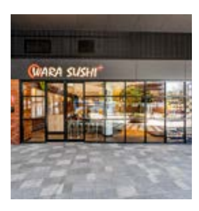
WEST END STORE